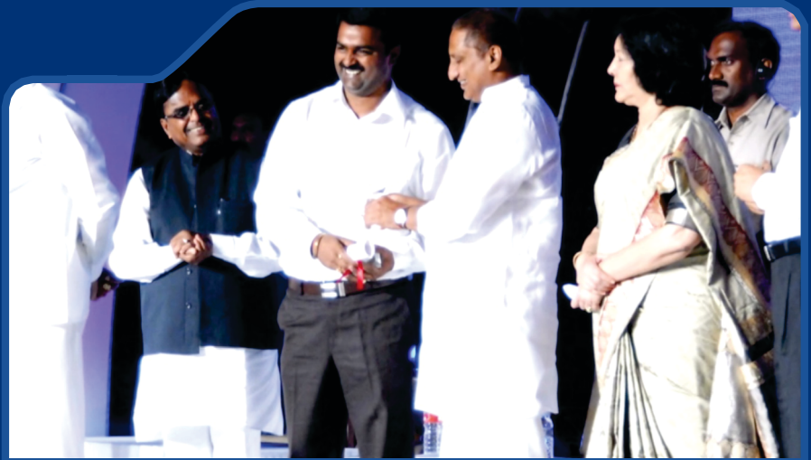
Receiving Business Leader of the Year Award From Hon'ble Chief Minister Sri. N. Kiran Kumar Reddy Award Year - 2013

Honored by the names that recognize our vision