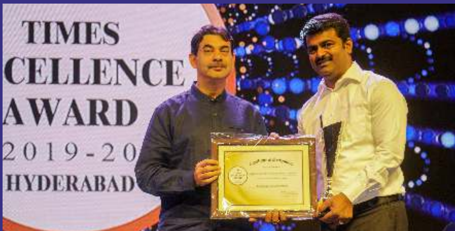
Receiving Times Excellence Award Year 2019-20