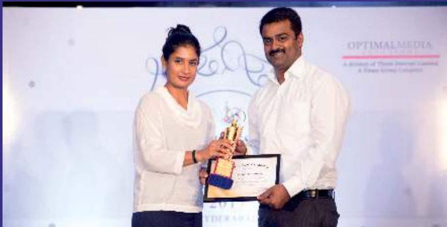
Receiving Times Education Award From Indian Womens Cricket Team Captain Mithali Raj Award year - 2017