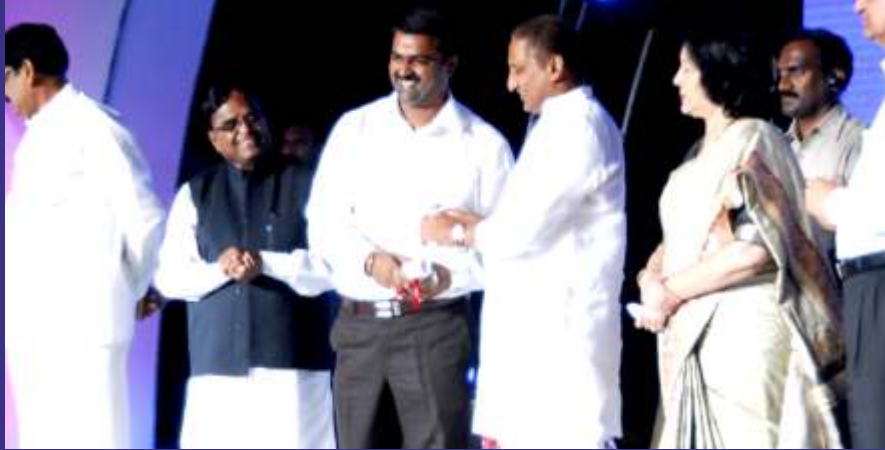
Receiving Business leader of the year award from Honorable Chief Minister Sri N. Kiran Kumar Reddy Award Year - 2013