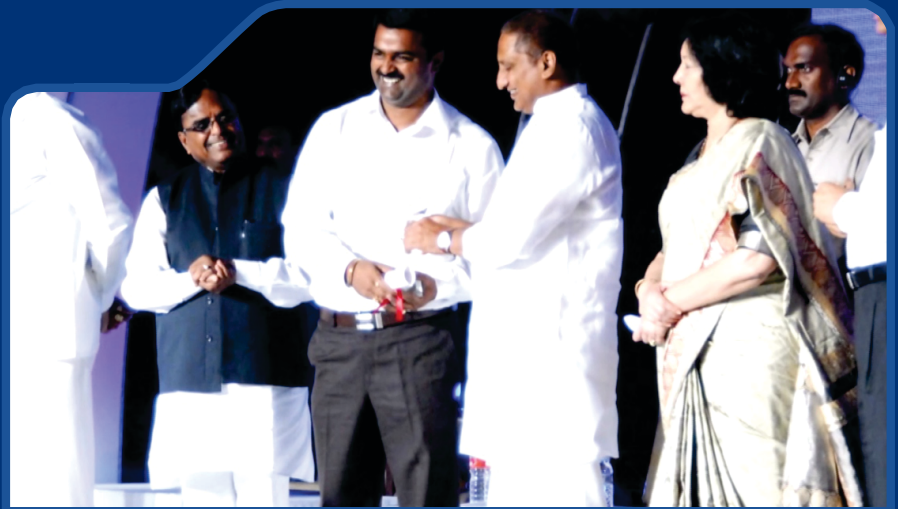
Receiving Business Leader of the Year Award From Hon'ble Chief Minister Sri N. Kiran Kumar Reddy Award Year - 2013