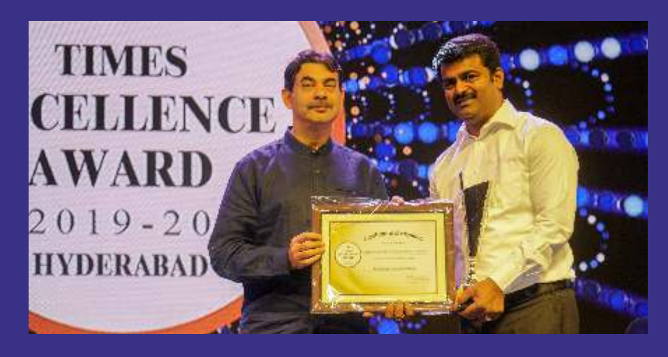
Receiving Times Excellence Award Year 2019-20